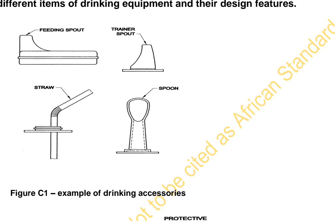
Figure C1 - example of drinking accessories

Typical examples of different items of drinking equipment and their design features.